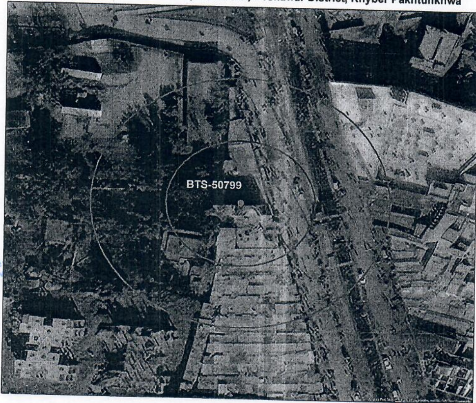
Base Transceiver Station (BTS-50799) Peshawar District, Khyber Pakhtunkhwa