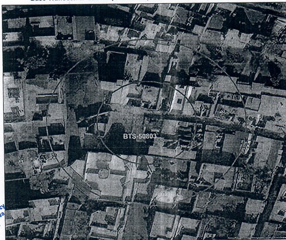
Base Transceiver Station (BTS-50803) Peshawar District, Khyber Pakhtunkhwa