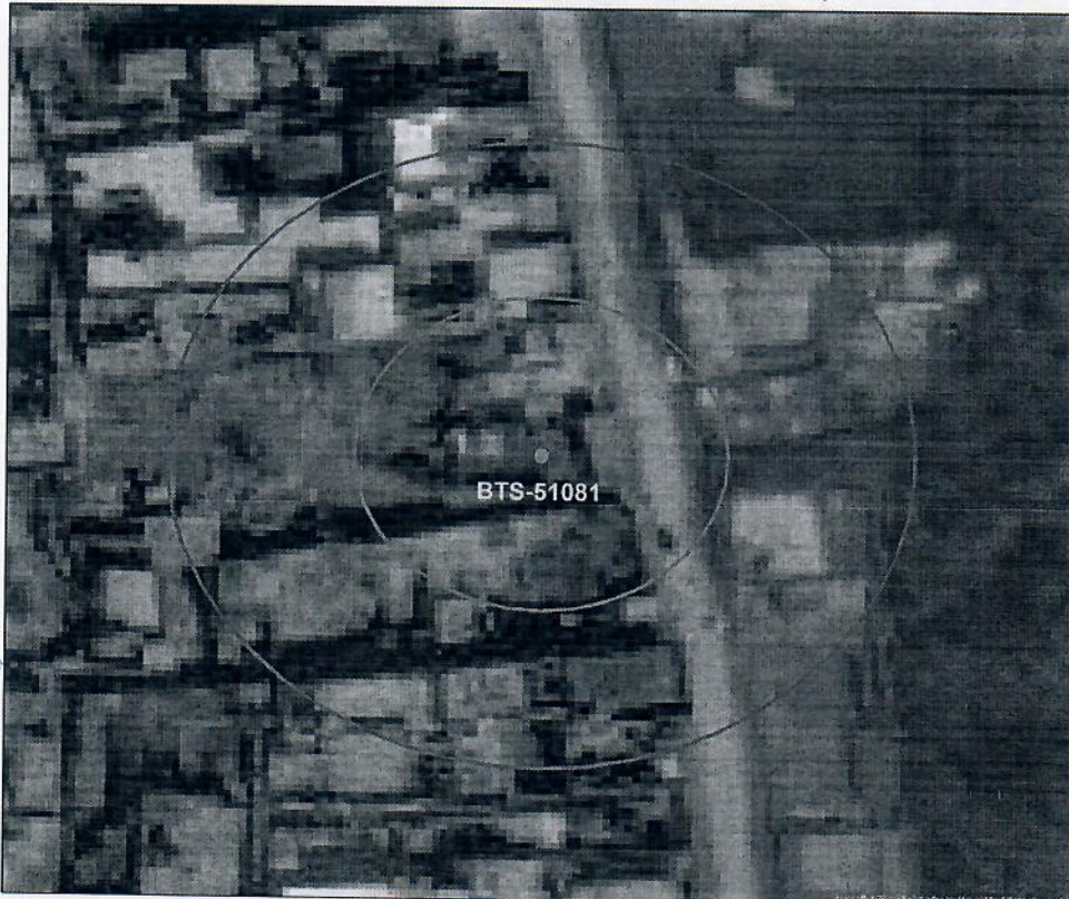
Base Transceiver Station (BTS-51081) Nowshera District, Khyber Pakhtunkhwa