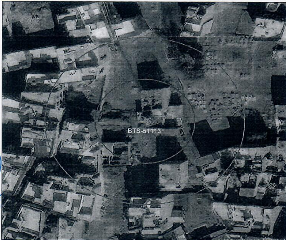
Base Transceiver Station (BTS-51113) Peshawar District, Khyber Pakhtunkhwa