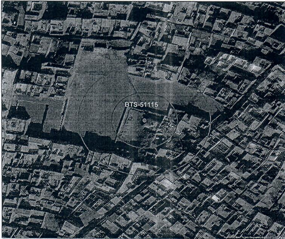
Base Transceiver Station (BTS-51115) Peshawar District, Khyber Pakhtunkhwa