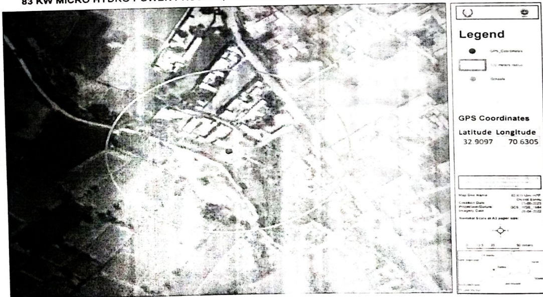
83 KW MICRO HYDRO POWER PROJECT, SAKANDAR JALAT, TUGHAL KHEL, DISTRICT BANNU