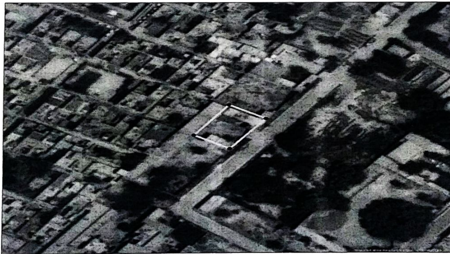
FARSI SEEDS CORPORATION, PLOT NO. 27,28, SMALL INDUSTRIAL ESTATE , ZAFAR ABAD, DISTRICT D. I. KHAN