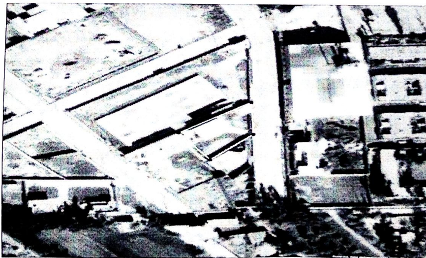
GERMAN PLASTIC PVC PIPE INDUSTRY SMALL INDUSTRIAL ESTATE, KOHAT

DIRECTOR Environmental Protection Agency Southern Region, D.I.Khan Govt. of Khyber Pakhtunkhwa.