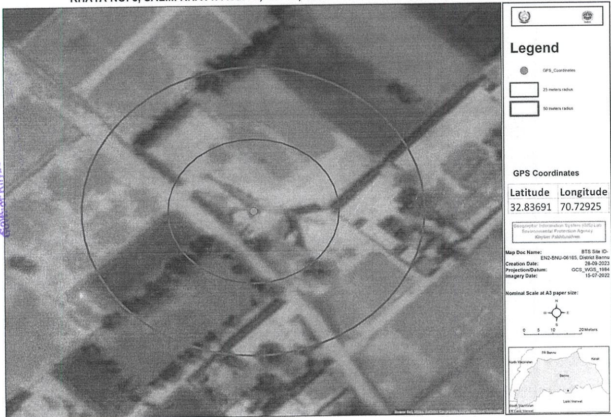
ENGRO ENFRASHARE (PRIVATE) LIMITED BTS SITE ID EN2-BNU-06165, PLOT BEARING KHATA NO. 5, SALIM KHATTA NO. 76, 497-19, TEHSIL & DISTRICT BANNU

DIRECTOR Environmental Protection Agency Southern Region, D.I. Khan, J. Government of Khyber Pakhtunkhwa