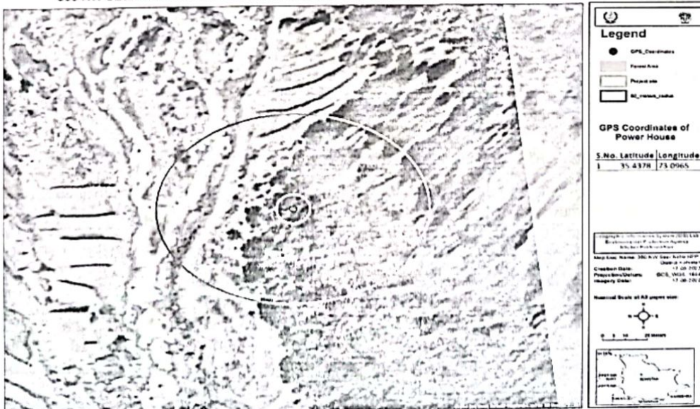
360 KW SEER KOTLOO DUNG MICRO HYDRO POWER PROJECT DISTRICT KOHISTAN