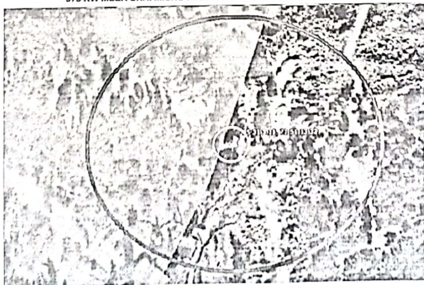
975 KW MEER SHAI MICRO HYDRO POWER PROJECT DISTRICT KOHISTAN