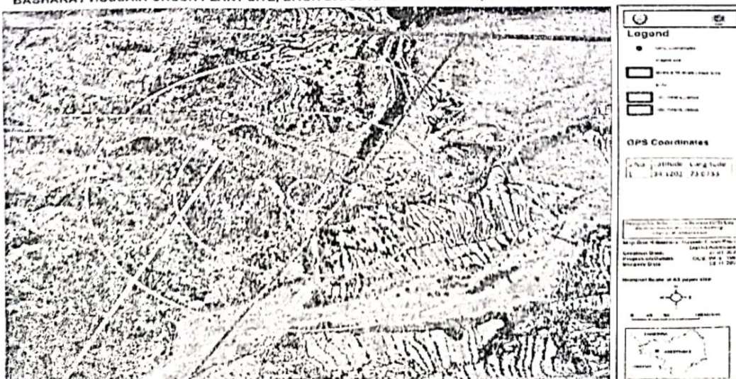
BASHARAT HUSSAIN CRUSH PLANT SITE, BAGH DARA TEHSIL HAVELIAN, DISTRICT ABBOTTABAD