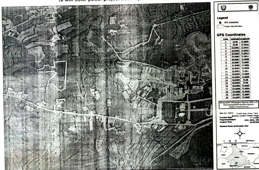
16 MW Solar power project Bestway Cement Hattar

5. Date of Filing of IEE: 11/03/2024 (Ref: EPA Diary No.2361) EPA Northern Directorate.